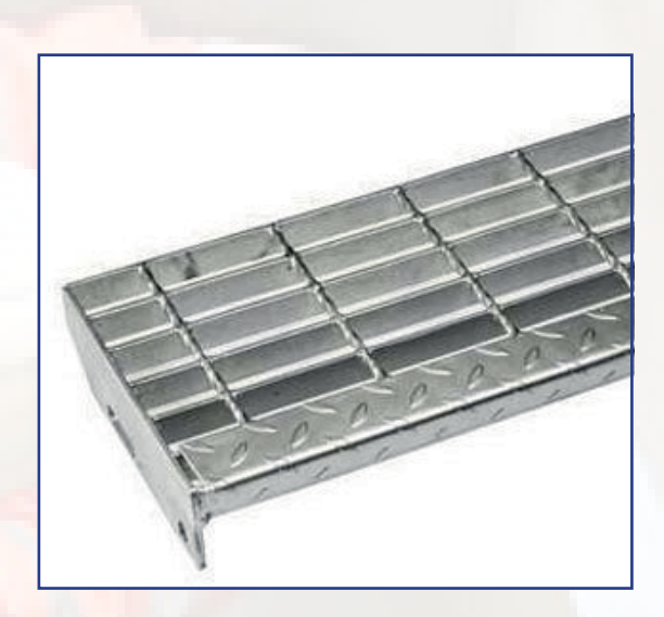
Profiled Floor Gratings